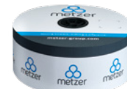
Dark Grey line - 8 mil (0.2 mm) and up