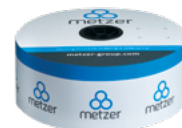
Blue line - 6 mil (0.15 mm)